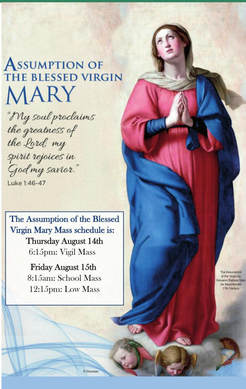
The Assumption of the Virgin by Giovanni Battista Salvi da Sassoferrato 17th Century