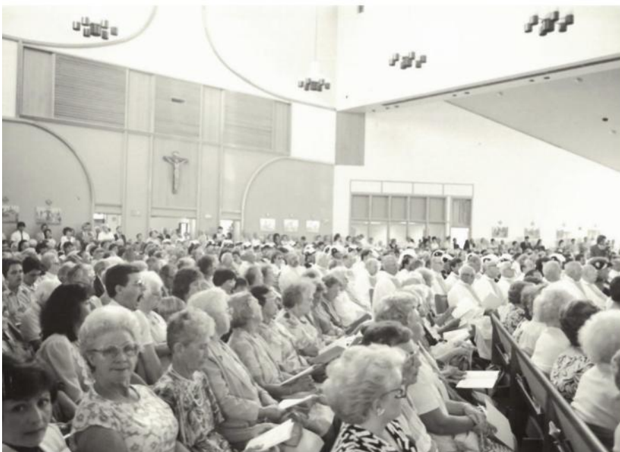
We found this picture of the 1986 dedication of our church. Wouldn't it be great to see our church full like this every week?"

Every week I come into church & check out who is new to me in the area I sit. It makes my heart feel so good to meet parishioners I don't know to let them know we welcome them to be part of our "family" at Sacred Heart!