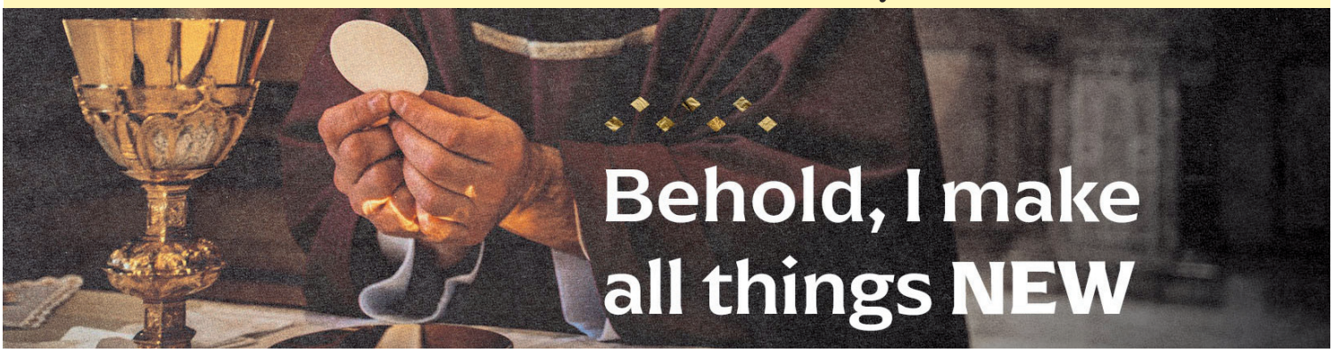
The National Eucharistic Revival is a 3-year effort to increase understanding and devotion to our Lord's presence in the Eucharist. While the parish-level phase will begin next year, each of us can begin this journey of discernment and encounter through personal reflection. This series of articles is one way to do that.